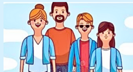
Parents and Adolescents Wellbeing Project